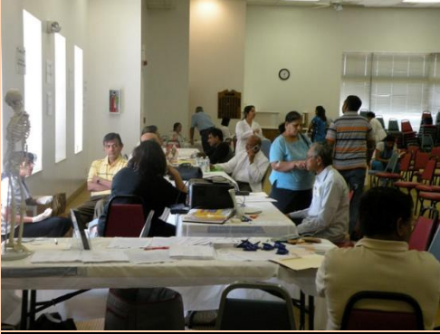
Registration and health checkup

were sponsored by St Anthony's Medical center and the cost of the fair was borne by the Humanitarian committee of the Hindu Temple.