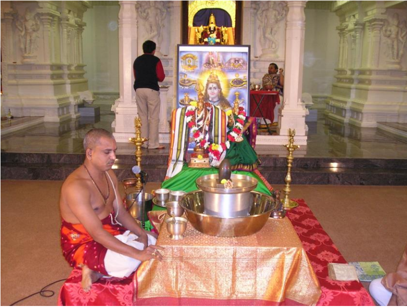
Devotees performed abhishekam for Lingam.

Kartika Somararams are celebrated with special poojas for Lord Shiva. Mahajyotilingarchana, Samuhika Rudrabhishekam, Manayasapoorvaka Rudhrabhishekam are performed.