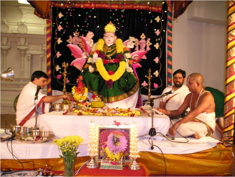
Devi as Shri Lakshmi